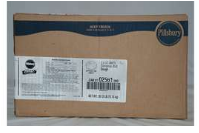
Case / box wide front side 1