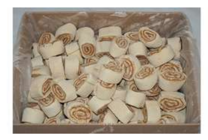
Case / box inside view