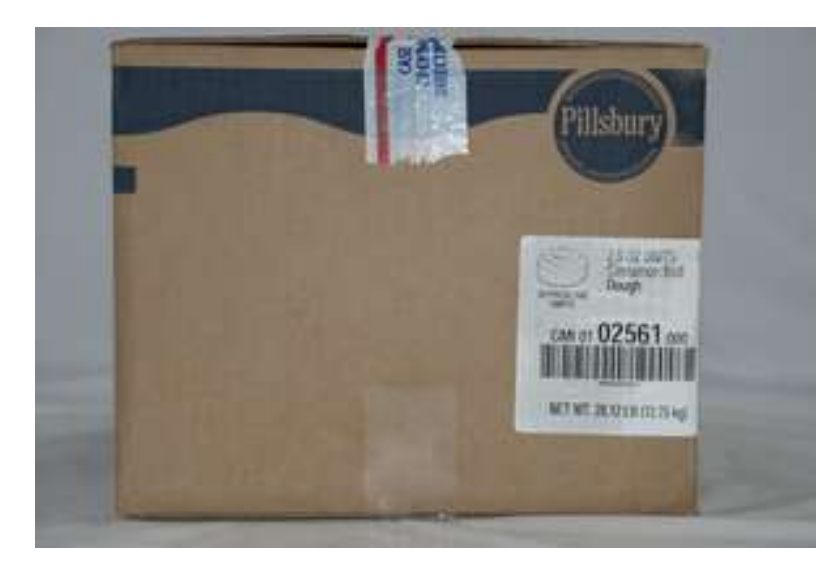
Case / box short side 2