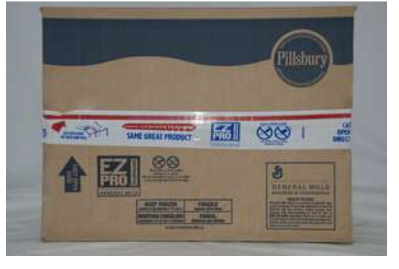
Case / box top