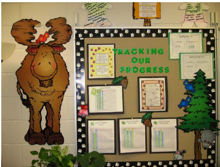
Figure 3 Classroom Data Centers